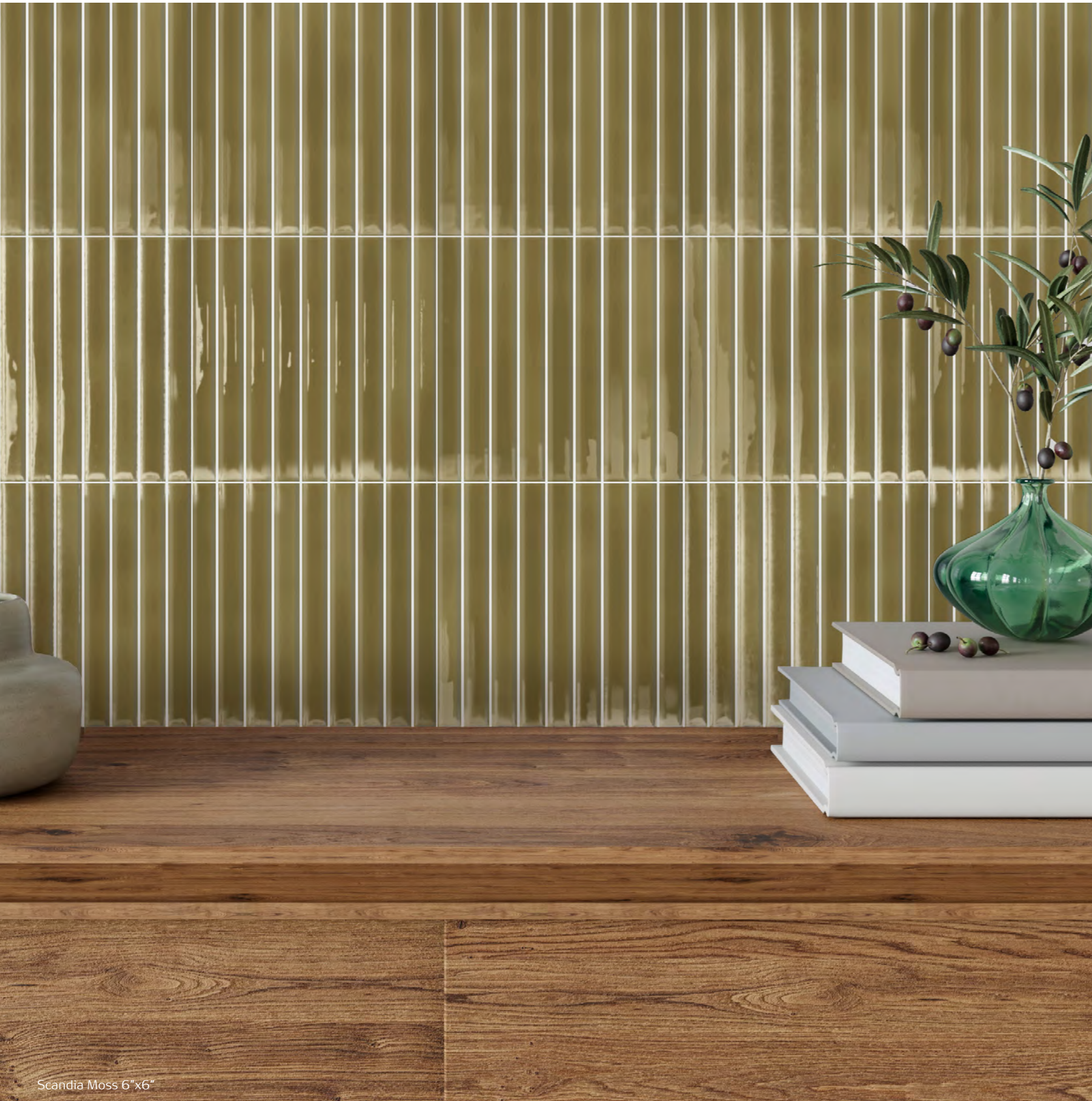
Scandia Moss 6"x6"

Inspired by Nordic simplicity, Scandia brings texture and tranquility to the surface. Its refined 3D kit-kat design creates a rhythmic, linear pattern that adds depth and subtle shadow play to any wall. The palette evokes calm skies, natural landscapes, and clean architectural spaces. The dimensional format enhances light and movement, transforming simple walls into tactile, modern statements. Scandia is where minimalism meets texture – fresh, structured, and effortlessly contemporary.